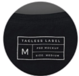
Tagless Neck Label

Now print on hoodies & a lot more with the all new standard pallets!